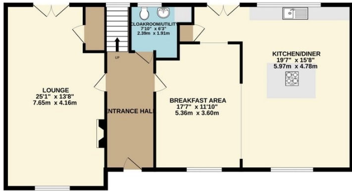
GROUND FLOOR 1096 sq.ft. (101.8 sq.m.) approx.